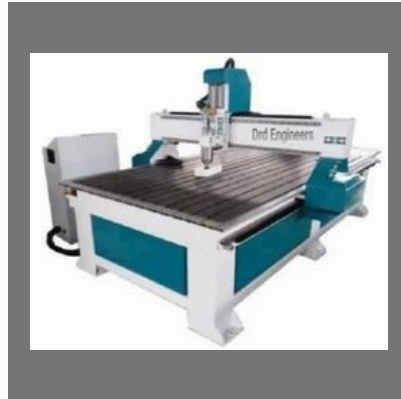
CNC Wood Router Cutting Engraving Machine