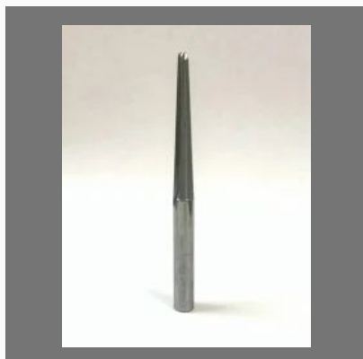
Mild Steel Wood Carving Tool