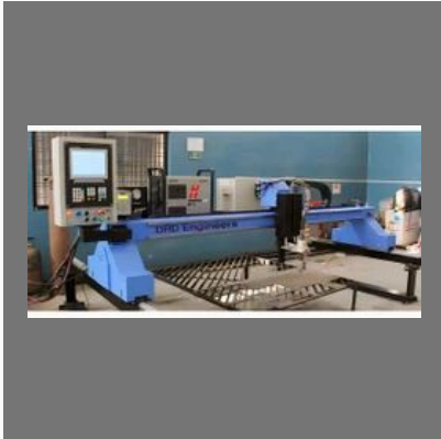
Mild Steel CNC Profile Plasma Cutting Machine