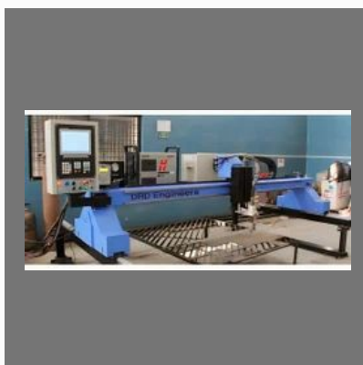
CNC Profile Cutting Machine