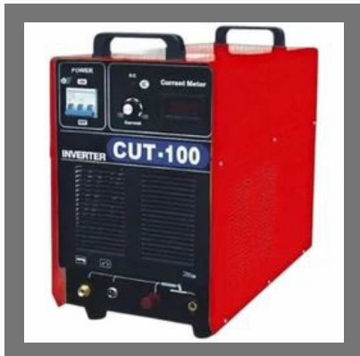
220V Inverter Plasma Cutting Machine