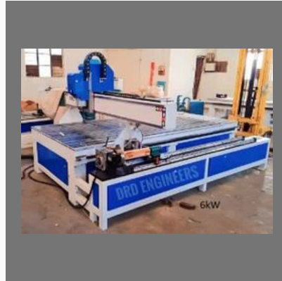
6kW CNC Router Machine