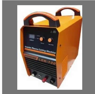
Taiwan Corporation LGK 100 Cut Plasma