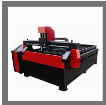
220V Gas CNC Plasma Cutting Machine