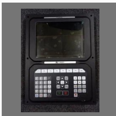
F2300b Cnc Plasma Controller