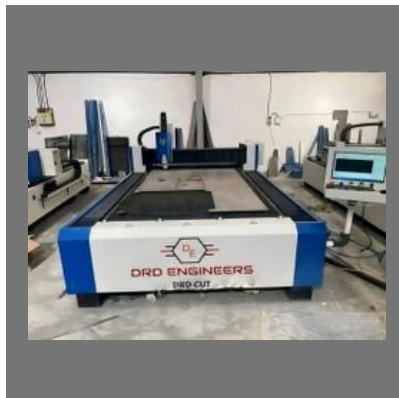
CNC Fiber Laser Cutting Machine