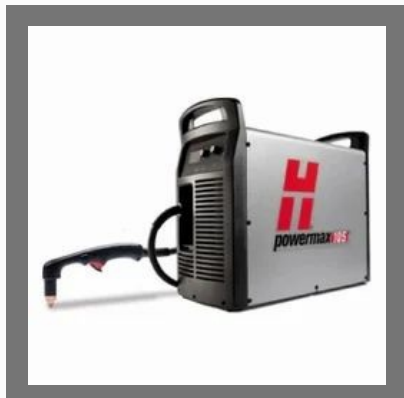
Hypertherm Powermax 105 Plasma Cutter