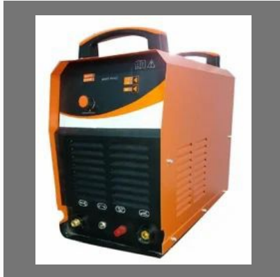
Manual Inverter Plasma Cutting Machine