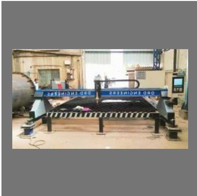
Mild Steel CNC Table Type Plasma Cutting Machine