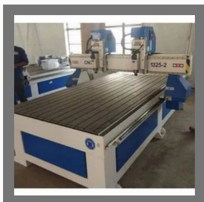
Dual Head Cnc Router Cutting Engraving Machine