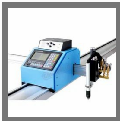
Cnc portable Plasma Profile Cutting Machine